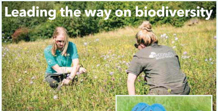
■ Ecosulis surveying species present at Barton Farm Meadow

The Town Council has adopted a biodiversity policy - following on from its declaration of a Climate and Ecological Emergency - including the appointment of a local company to carry out an in-depth survey that will act as a benchmark against which to monitor future progress. The policy, adopted in June, bans the use of glyphosate and other chemical weed-killers, as well as peat-based compost, in council-managed locations and contracts. It also requires that mowing and cutting programmes be reassessed, with an emphasis on promoting natural biodiversity as far as possible, in line with local eco-systems.